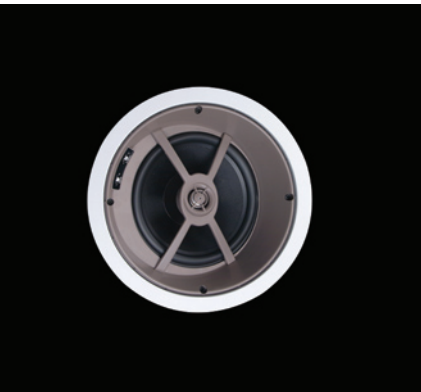
C870 LCR Ceiling Speaker

Quality-built, of course. Exactly what you'd expect from a premium brand like Proficient.