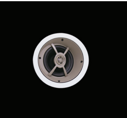
C660 LCR Ceiling Speaker