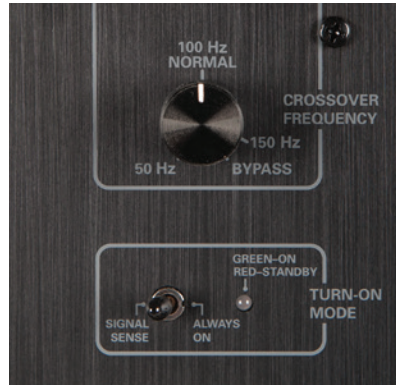
High Output Class D Amplifier

So whether you're listening to movies or music, or using them in a two-channel stereo system or a home theater surround-sound system, they do all this with enhanced reliability and a longer warranty. Quality built, of course. Just like you'd expect from Proficient.