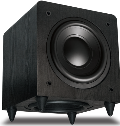
Dual Driver Design

We were always happy with the sound of our PS-series subwoofers, and our customers were, too. But subwoofer design — the drivers, the amplifiers, the tuning — has advanced a long way since we created the PS-series.